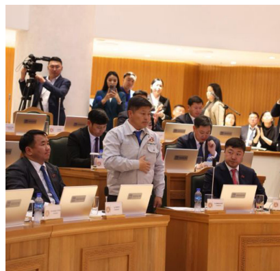
At the first session of the Citizens' Representatives Khural of the Capital City,

The Heads of Government agreed that institutionalizing this level of trilateral meetings between Mongolia, China, and Russia is not only key to activating tangible trilateral cooperation and advancing major strategic joint projects but is also in line with the common regional interest of peace and sustainable development of Asia. The next trilateral meeting between the Heads of Government will be held in 2025.